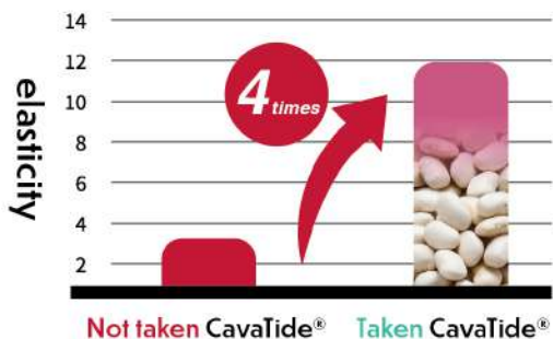
Patented Canavalia Ensiformis CavaTide®